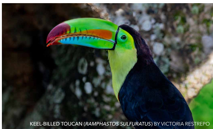
KEEL-BILLED TOUCAN (RAMPHASTOS SULFURATUS) BY VICTORIA RESTREPO