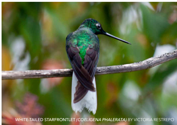
WHITE-TAILED STARFRONTLET (COELIGENA PHALERATA) BY VICTORIA RESTREPO

Transfer to the airport for return flights to the U.S. (B)