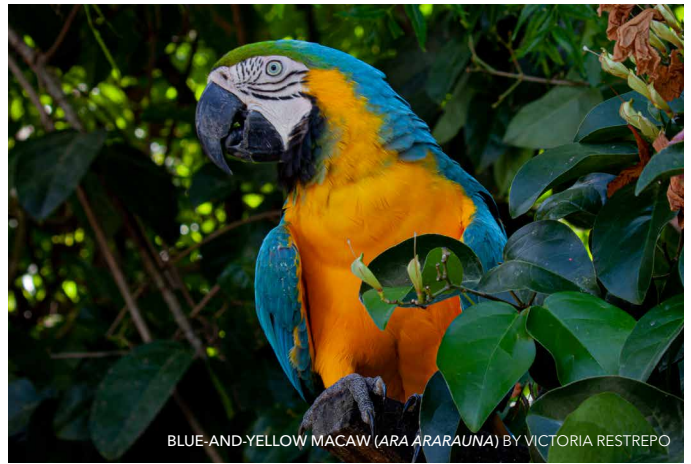
BLUE-AND-YELLOW MACAW (ARA ARARAUNA)

Flycatchers, Cinereous, Cinnamon, and White-winged Becards, Masked Tityra, Rufous-breasted and Rufous-and-white Wrens, Yellow-legged, Black-hooded, Pale-breasted, and Black-billed Thrushes, Black-chested Jay, Golden-fronted Greenlet, Brown-capped Vireo, Orange-billed Nightingale-Thrush, Rusty Flowerpiercer, Bay-headed, Black-headed, Black-capped, Blue-gray, Palm, White-lined and Crimson-backed Tanagers, Streaked and Grayish Saltators, Golden-winged Sparrow, Yellow-bellied Seedeater, Yellow-backed Oriole, Crested Oropendola, Thick-billed Euphonia, and many others. Lowlands of Sierra Nevada de Santa Marta: elevation 2,620-7,550 feet, average temperatures 59-77°F. Overnight at El Dorado Lodge. (BLD)