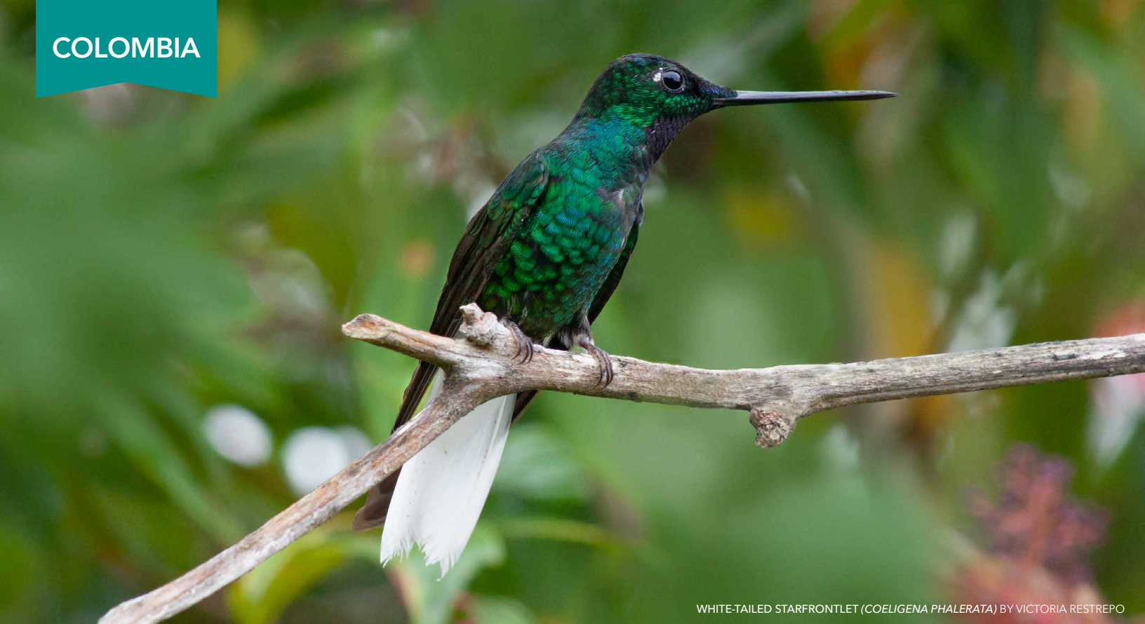
WHITE-TAILED STARFRONTLET ( COELIGENA PHALERATA ) BY VICTORIA RESTREPO